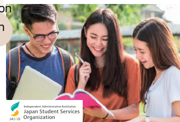
Independent Administrative Institution Japan Student Services Organization