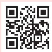
PrEP for dummies

PrEP is a medication proven to be effective for preventing HIV when taken following a physician's assessment. Please scan the QR-code for more information.