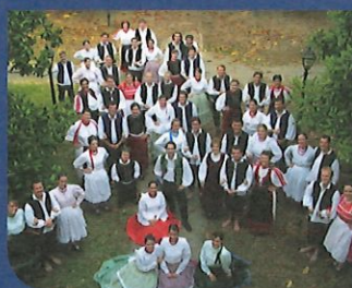
Cantemus混聲合唱團 Cantemus Mixed Choir (匈牙利) 指揮 | 薩伯 Soma Szabó, conductor

經典音樂會邀請團隊 Invited Choirs for Premium Concerts